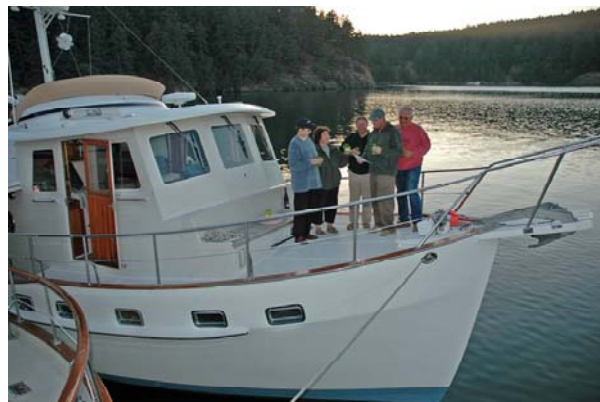
Nestled with CHUG