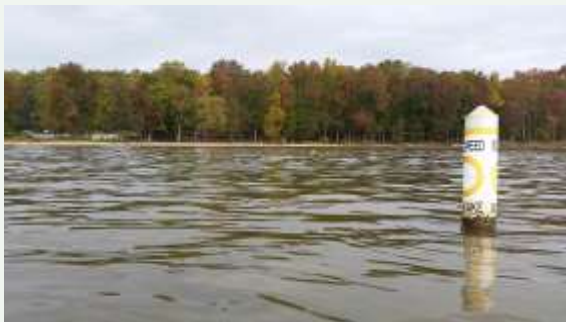
Our beach for the day from the water.

encouragement to keep the squadron active and involved with teaching.