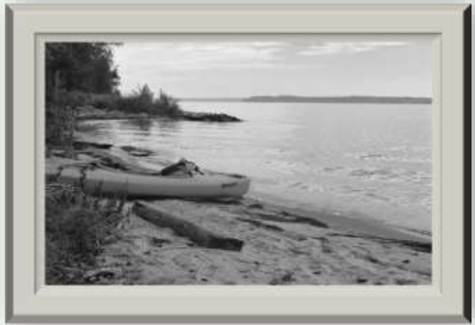
Monarch on the Beach by Lena Sowers

Claire gave instructions on where to put my feet and adjust the feet stoppers, where to place your hands on the paddle so you can feel