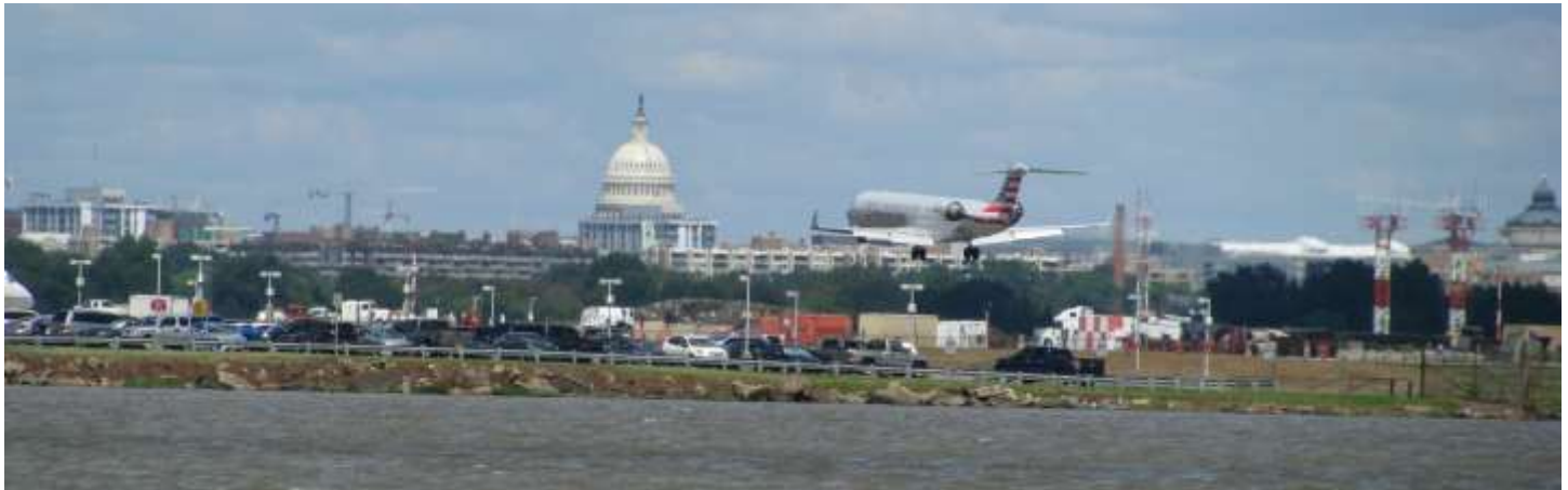
Above: View from Washington Sailing Marina. Unique marina to have view of Nation's Capitol and Ronald Reagan National Airport. Below: 1 of the 3 cranes. Spinnaker'n Spoke shop has a small lounge inside and lots of seating outside, boat supplies.