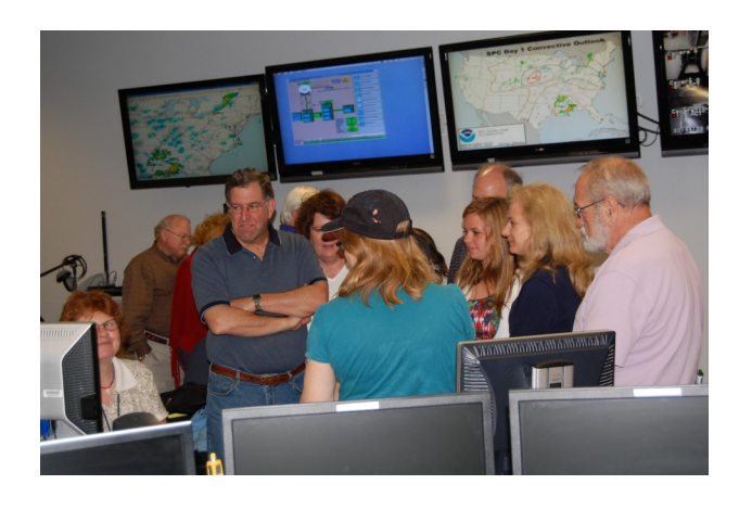
Looking at the Skew-T of the downloading data from the radiosonde and briefed on the forecast center "hear t"