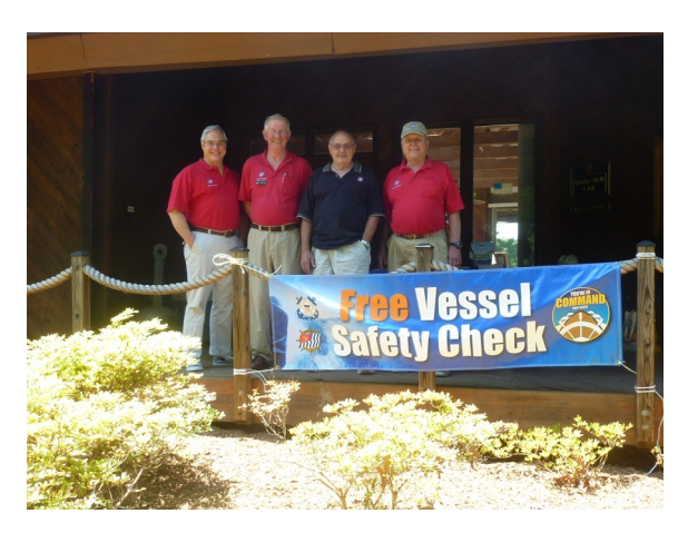
Vessel Examiners are a critical part of our program.