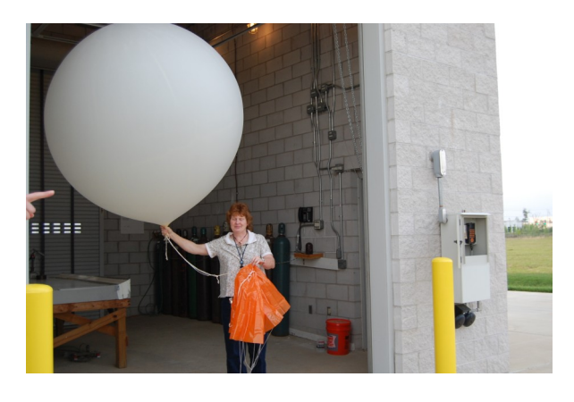
Preparing balloon and radiosonde for launch