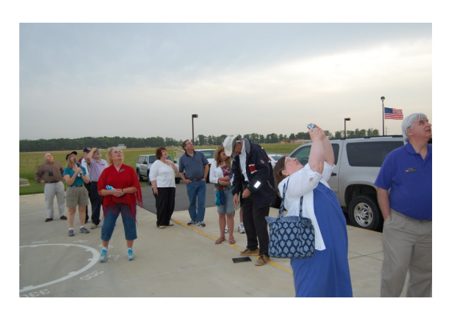
Question: what do you do when a weather balloon is launched?