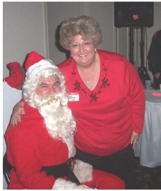
District Cdr & Elf