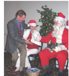
Editor meets the Clauses

From Rte 123 North or South: Proceed to Fairfax City and take Route 236 West, 3 blocks, right on Oak Street, 2 blocks to 3939 on the right.