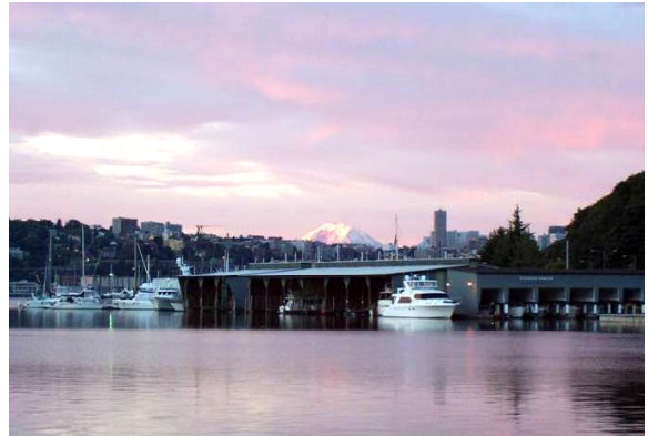
Safely back in Seattle's Lake Union