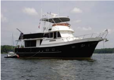
MV Adventures & Tender