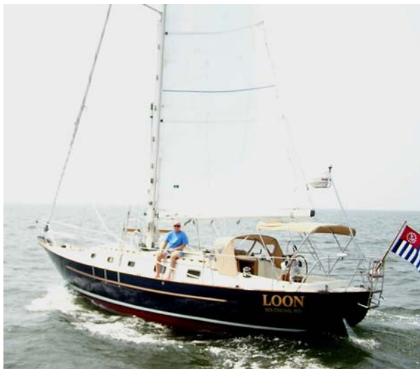
A loon and his boat

Local knowledge of depths immediately ahead of the bow, where depth finders do not give enough advanced warning, can be obtained by "reading" the water. The color of the water is essential, especially in finding an anchorage. To read the water correctly you need to have the sun high and behind you. Coral heads and shallow sandy shoals abound, and even though your charts may indicate them, a change in water color is your safest bet. Deep blue water is deep safe water; it's found in the gulf stream, Tongue of the Ocean, east and west