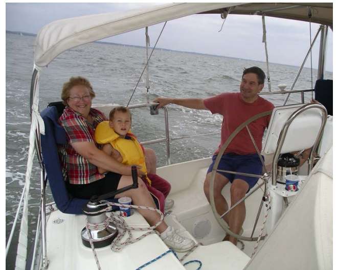
SV Celestial: crew & wannabe