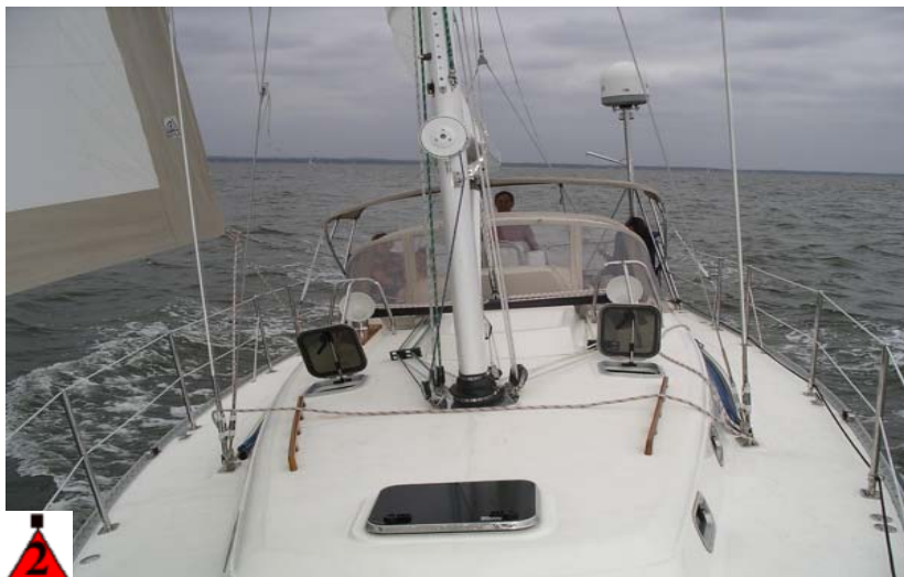
SV Celestial in Herring Bay